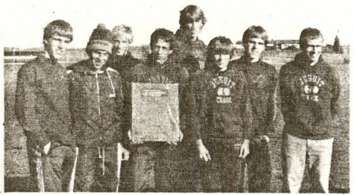
JESUIT HIGH SCHOOL, Northern California Champs