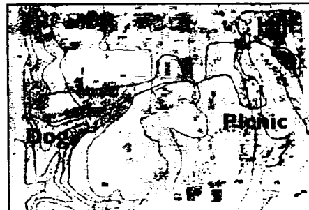
A rare aerial view of Morley Field shows the fabled CIF course outlined in red, meandering up and down the rough contours of the park (black lines). Boys run dog-picnic-hill-dog-hill-picnic (3.04 miles). Girls run dog-picnic-hill-dog-picnic (2.75 miles).

Junior Jaclyn Christopher leads heavily favored Santa Fe Christian returning to defend their 04 championship. After running a strong 18:13 (2.75 miles) at